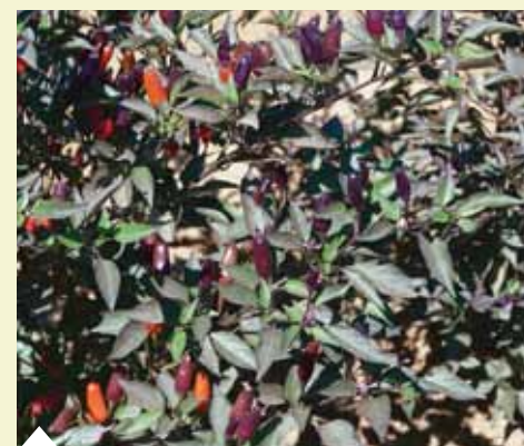
Ornamental pepper 'Black Olive' (Seeds by Design).

Pepper 'Cayenetta' (Floranova Ltd.) 'Cayenetta' is a tasty, mildly spicy pepper that is easy to grow, even for novice gardeners. This 3- to 4-inch chili pepper yields large fruits from a well-branched, upright plant. It requires no staking, making it perfect for a container or patio planter. Unique to this variety is its cold tolerance as well as dense foliage cover to protect the fruits from sun scorch. It also handles heat extremely well.