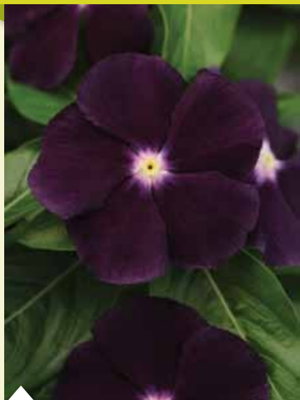
Vinca 'Jams 'N Jellies Blackberry' (PanAmerican Seed).

This superb accent plant will perform beautifully in combination with blue, pink, white or lavender. It has extremely unique, velvety deep-purple flower color with a white eye. Mature plants will reach 10 to 14 inches tall, making them a perfect medium height divider. The 2-inch flowers are complimented by deep-green, shiny leaves.