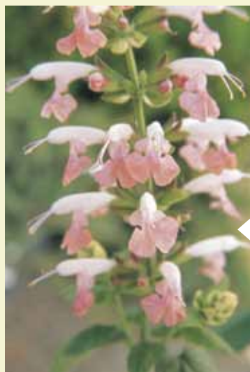
Salvia 'Summer Jewel Pink' (Takii & Co.)

This superb accent plant will perform beautifully in combination with blue, pink, white or lavender. It has extremely unique, velvety deep-purple flower color with a white eye. Mature plants will reach 10 to 14 inches tall, making them a perfect medium height divider. The 2-inch flowers are complimented by deep-green, shiny leaves.