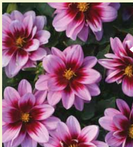
Dahlia 'Dalaya Yogi' (Selecta Klemm).

Growers and retailers visiting the trials fell for this variety's charming pink flower with its contrasting dark centers. This early-flowering, medium vigorous, mildew-tolerant dahlia is a new addition to the current range of cutting-raised garden dahlias. Growers can successfully produce floriferous, sturdy plants from cuttings in eight to 10 weeks following a straightforward scheme of topping and pinching requiring no growth regulation.